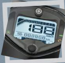
FULL DIGITAL INSTRUMENT CLUSTER

It's not often that a scooter ticks all the boxes you desire. The new Fascino 125 FI has it all. It's designed with style, packed with performance and gives you more miles for the buck. No wonder it's Shandaar, Dumdaar and Miledaar. Go ahead, ride-out on the new Fascino 125 FI and take centerstage.