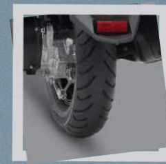
110mm WIDER REAR TYRE