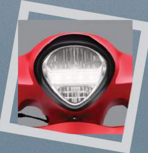
STUNNING LED HEADLIGHT WITH DRL