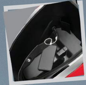
USB CHARGER (OPTIONAL)