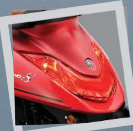
STYLISH LED TAILLIGHT