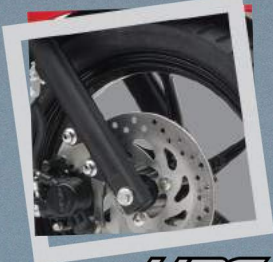
U3S Unified Braking System WITH DISC BRAKE & TELESCOPIC SUSPENSION