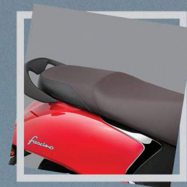
WIDE COMFORTABLE SEAT

PARKING RECORD Shows a route map from your current location to where you have parked your bike.