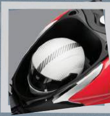
21L LARGE UNDER-SEAT STORAGE