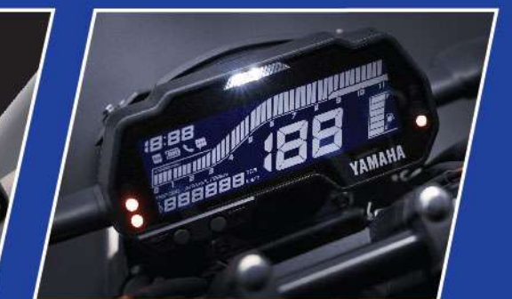
Advanced LCD Meter Console*