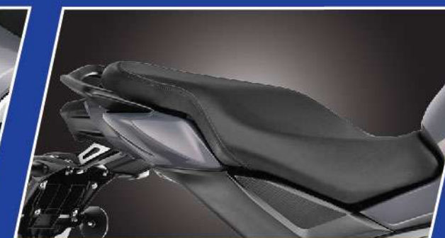
Comfortable Two-Level Seat