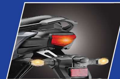
LED Flashers & LED Tail Light*