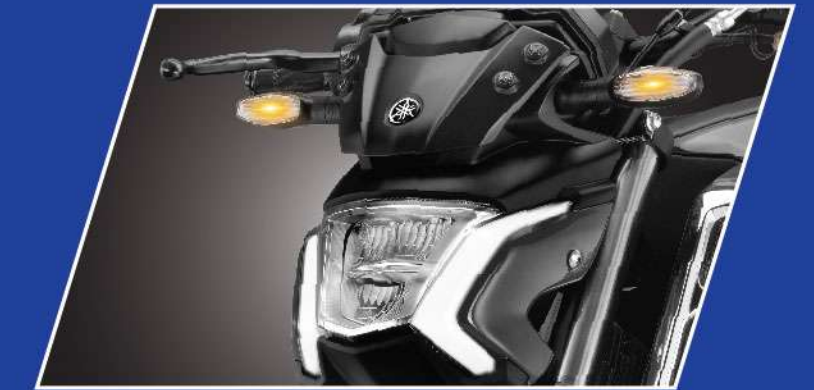
Newly Designed Class (D) Headlight With Position Lamp

The legendary streetfighter is loved for its superlative performance, advanced technology and macho street presence. Now, The Lord of the Streets takes the experience to a new level - with innovation, enhanced safety and new design features. One test ride and you'll know why the streets can have only one lord.