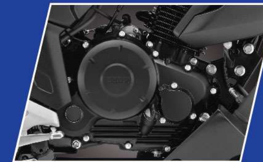
Trusted 149cc FI Engine