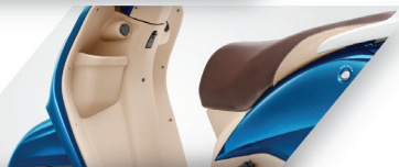
BEIGE INNER PANELS