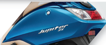
STURDY METAL BODY