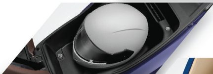
LARGER 21L UTILITY BOX