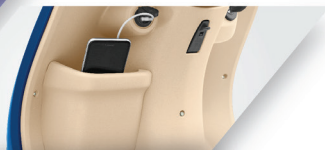
MOBILE CHARGER IN FRONT (OPTIONAL) WITH 2L GLOVE BOX