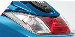
LED TAIL LAMP

The new TVS Jupiter strikes a balance between style and substance with unique features that gives you the element of style with each ride.