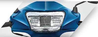
LED HEAD LAMP