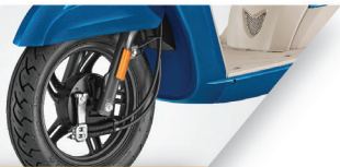
SYNC BRAKING TECHNOLOGY

The safety features of the new TVS Jupiter are tailored to keep the rider secure irrespective of changing conditions .