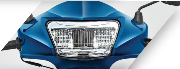
LED HEAD LAMP