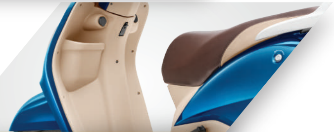
BEIGE INNER PANELS