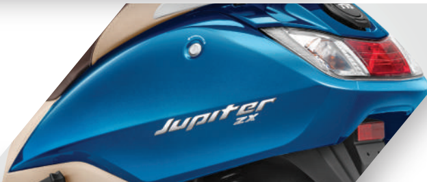
STURDY METAL BODY