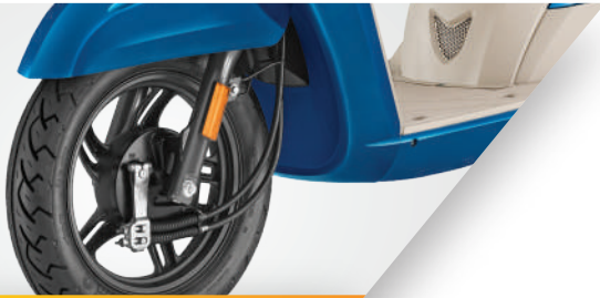
SYNC BRAKING TECHNOLOGY

The safety features of the new TVS Jupiter are tailored to keep the rider secure irrespective of changing conditions .