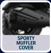
SPORTY MUFFLER COVER