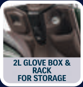
2L GLOVE BOX & RACK FOR STORAGE