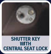
SHUTTER KEY WITH CENTRAL SEAT LOCK