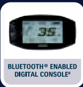
BLUETOOTH® ENABLED DIGITAL CONSOLE*