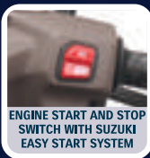
ENGINE START AND STOP SWITCH WITH SUZUKI EASY START SYSTEM