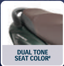
DUAL TONE SEAT COLOR*

To give your vehicle's seat an elegant finish.