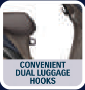
CONVENIENT DUAL LUGGAGE HOOKS