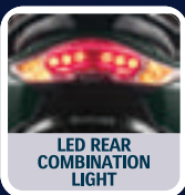
LED REAR COMBINATION LIGHT