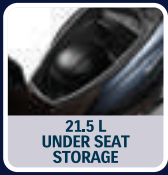
21.5 L UNDER SEAT STORAGE