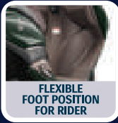
FLEXIBLE FOOT POSITION FOR RIDER