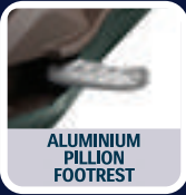
ALUMINIUM PILLION FOOTREST