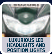
LUXURIOUS LED HEADLIGHTS AND POSITION LIGHTS