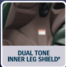
DUAL TONE INNER LEG SHIELD*

To give your vehicle's seat an elegant finish.