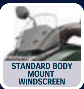
STANDARD BODY MOUNT WINDSCREEN