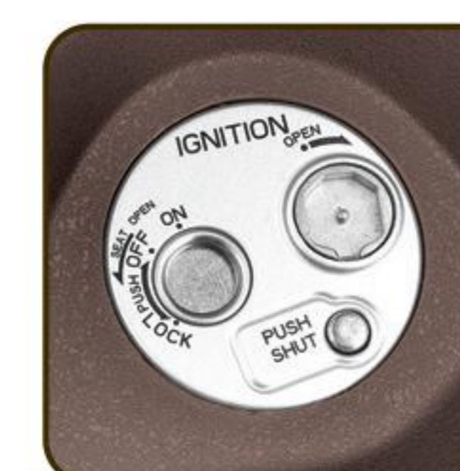
ONE PUSH CENTRAL LOCK SYSTEM