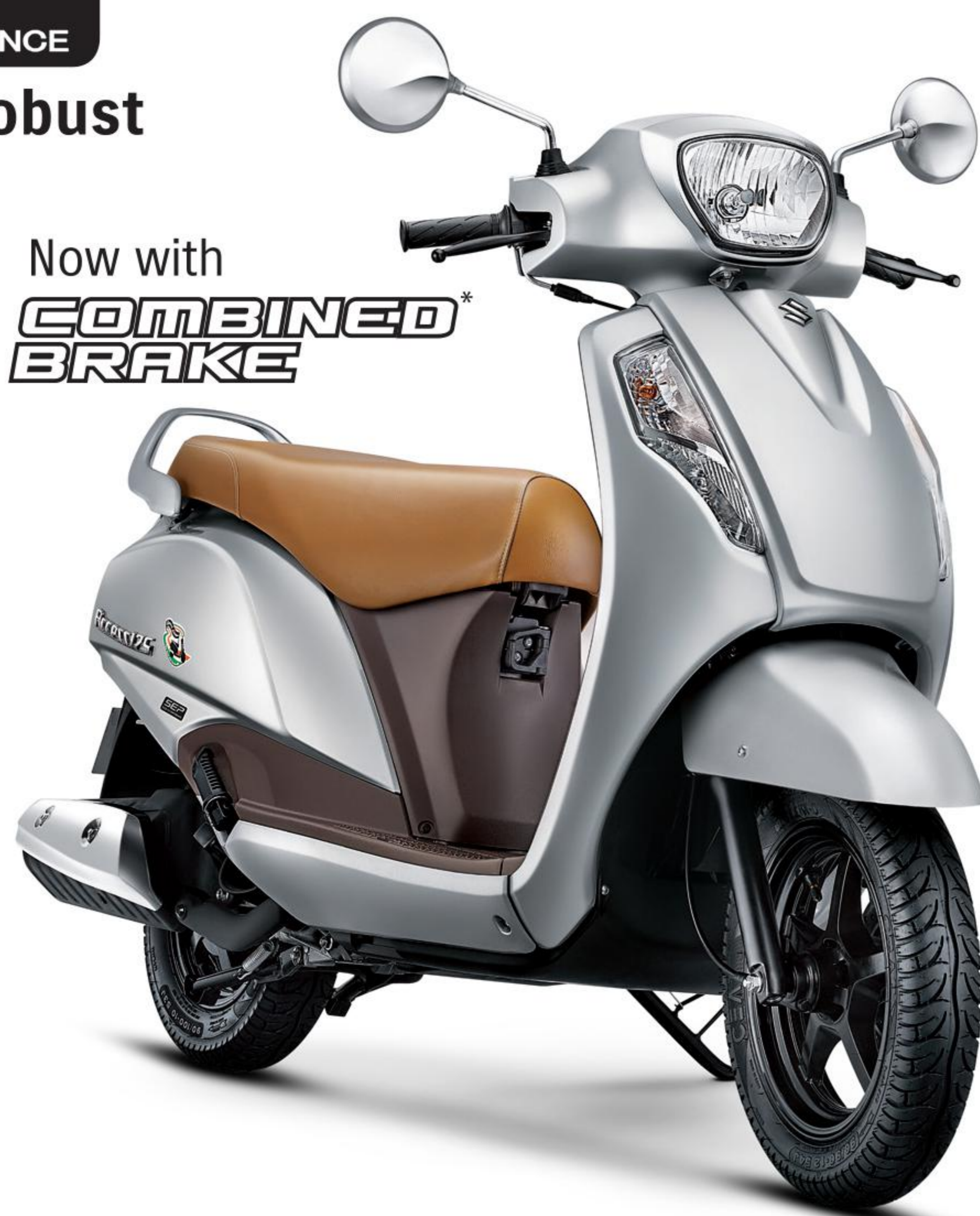
Metallic Sonic Silver (YD8)

CHROME HEADLAMP COVER, STEEL BODY & STEEL FENDER