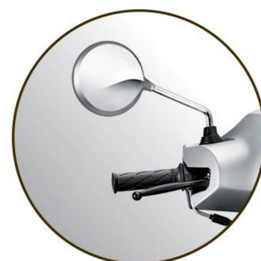
CHROME REAR VIEW MIRROR

CHROME HEADLAMP COVER, STEEL BODY & STEEL FENDER