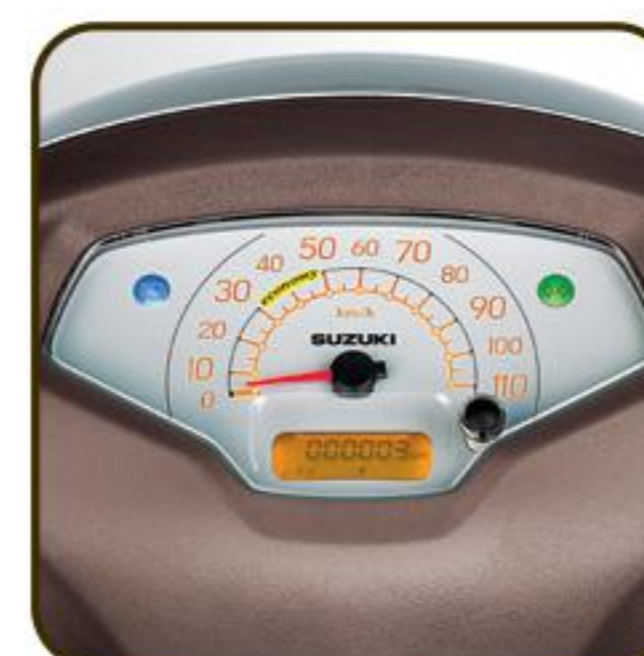
DIGITAL SPEEDOMETER TWIN TRIP METER SERVICE INDICATOR