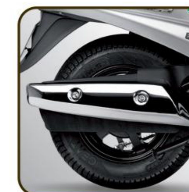
CHROME MUFFLER COVER