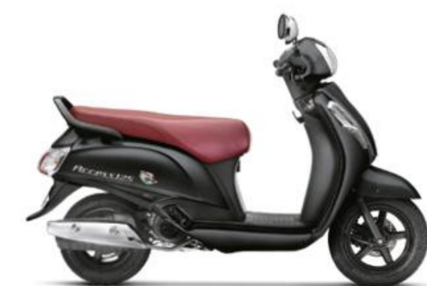
Metallic Matte Black (YKV)