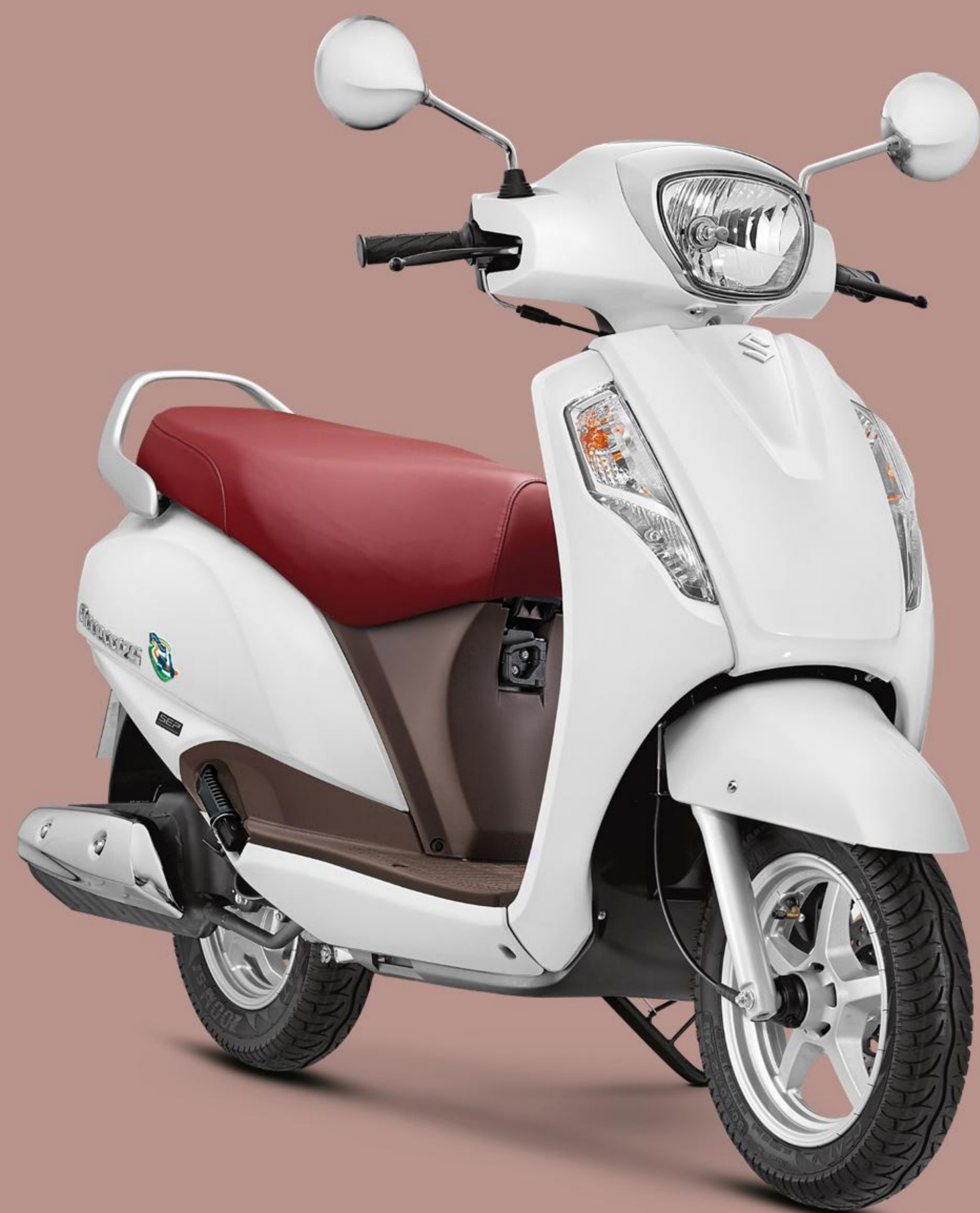
EASY START SYSTEM