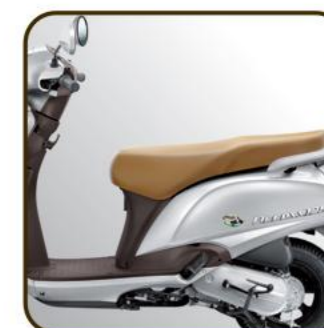
LONG SEAT & LONG FLOOR BOARD