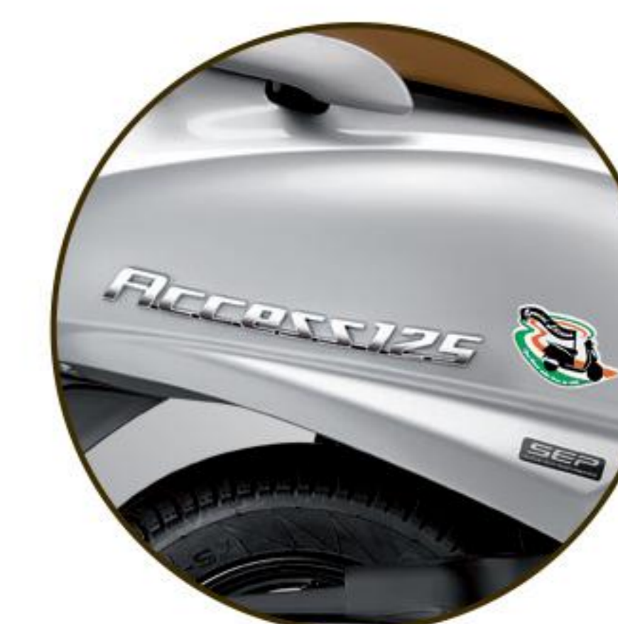
ACCESS SPECIAL EDITION LOGO