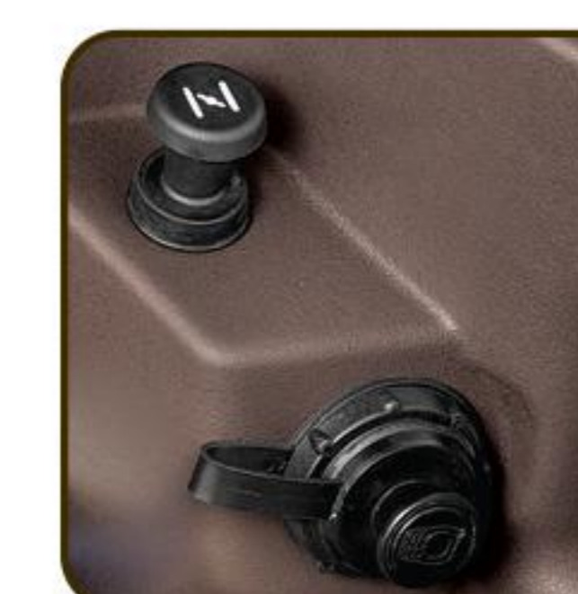
STANDARD DC SOCKET