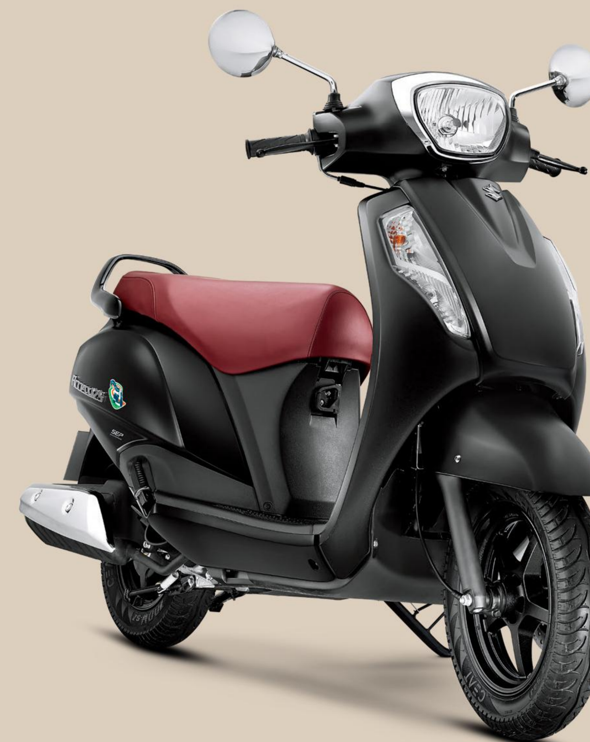
LONGER SEAT, BIGGER STORAGE