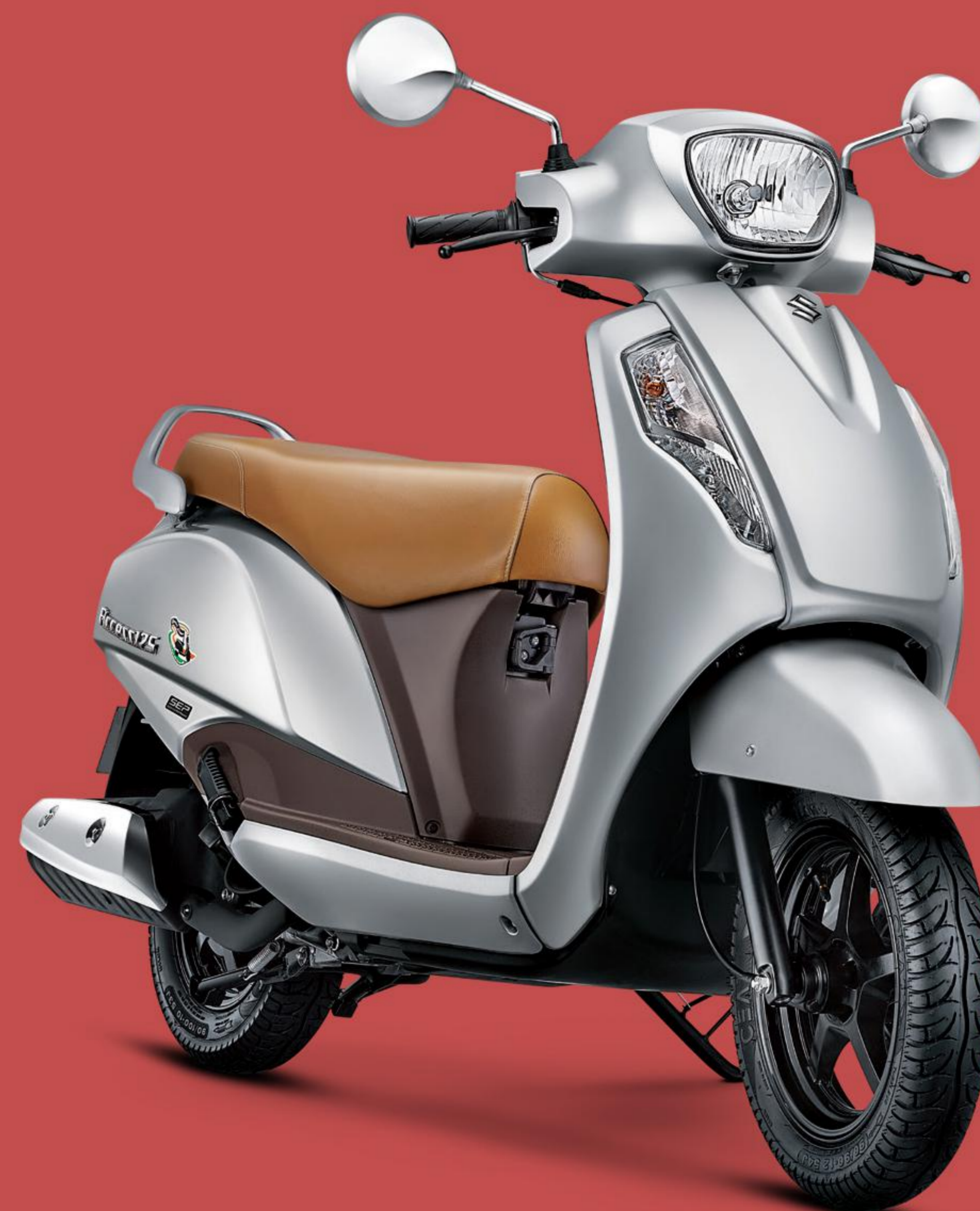
125CC SEP ENGINE