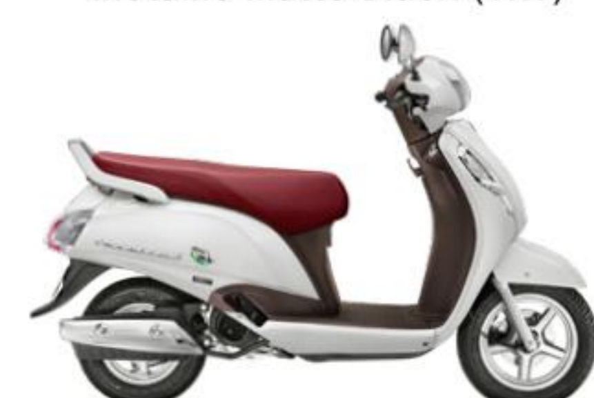
Pearl Mirage White (YPA)