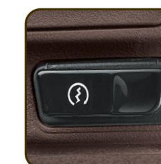
SUZUKI EASY START SYSTEM