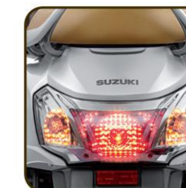
STYLISH TAIL LAMPS