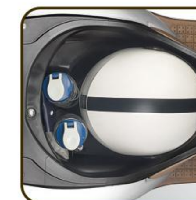
LARGE STORAGE SPACE