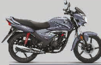
GENY GREY METALLIC