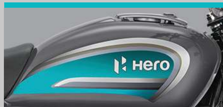
HEAVY GREY GREEN