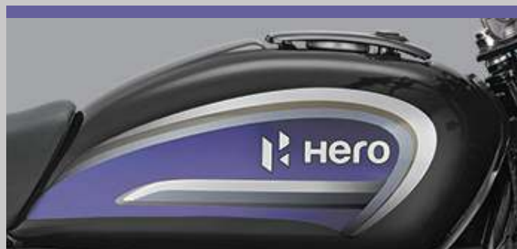
BLACK WITH PURPLE