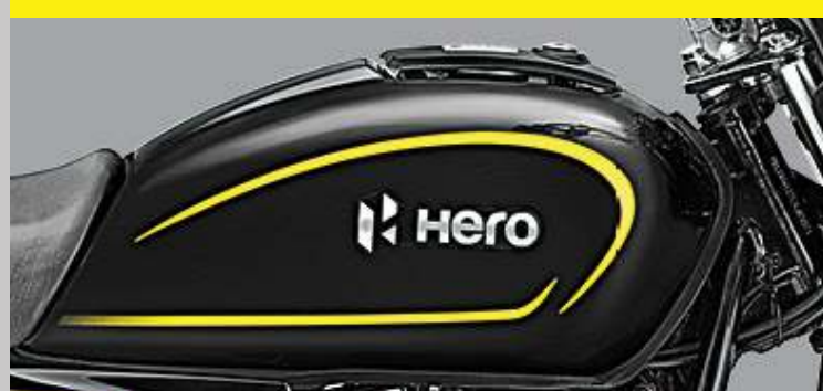
BUMBLE BEE YELLOW*