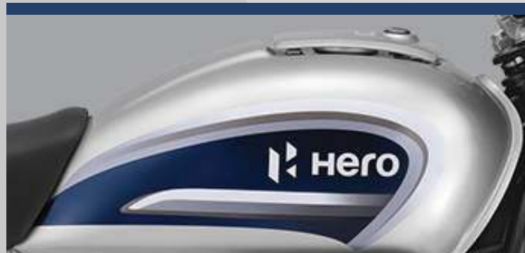
SILVER NEXUS BLUE