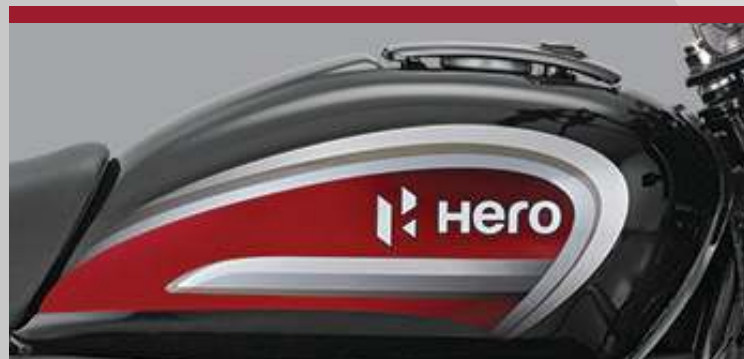
BLACK WITH RED