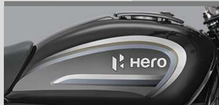
BLACK WITH SILVER