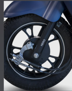
Regenerative Braking & Telescopic Suspension