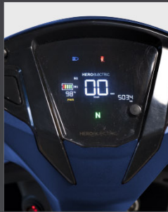
Smart Informative Instrument Cluster