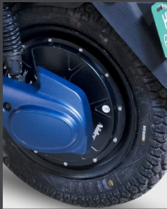
Powerful Hub Motor